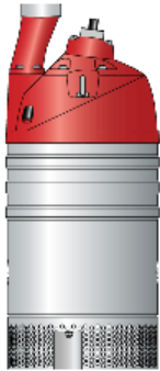
Maxi H Lite