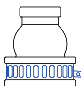
Model : FVT